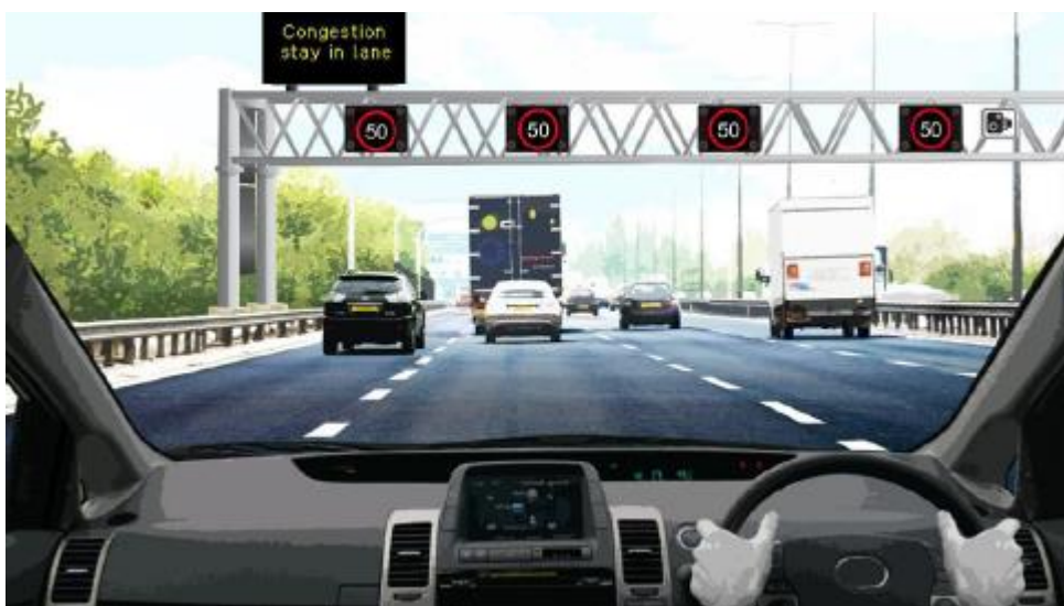
Figure 4c: Illustrative smart motorway all-lane running scheme section operating with variable mandatory speed limits

When variable mandatory speed limits are operational, clear instructions will be given to drivers via speed limit signs. These will be displayed on post mounted advanced motorway indicator signals (where provided), via speed limit signs displayed on the advanced motorway indicator signals or variable message signs above the main carriageway. This is illustrated in Figures 4c and 4d below. The speed limit displayed will take account of prevailing traffic conditions through detectors which are deployed throughout the scheme. The variable message signs located on gantries will provide further information for drivers.