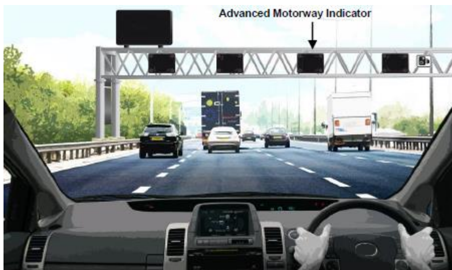
Figure 4a: Illustrative smart motorway all-lane running scheme section operating in normal motorway conditions with blank advanced motorway indicators and blank gantry mounted variable message sign

During normal motorway operation the advanced motorway indicators (AMI) and variable message signs (VMS) will remain blank in respect of speed limits and the motorway will operate as shown in Figures 4a and 4b below. When there are no speed limits being displayed the national speed limit will apply.