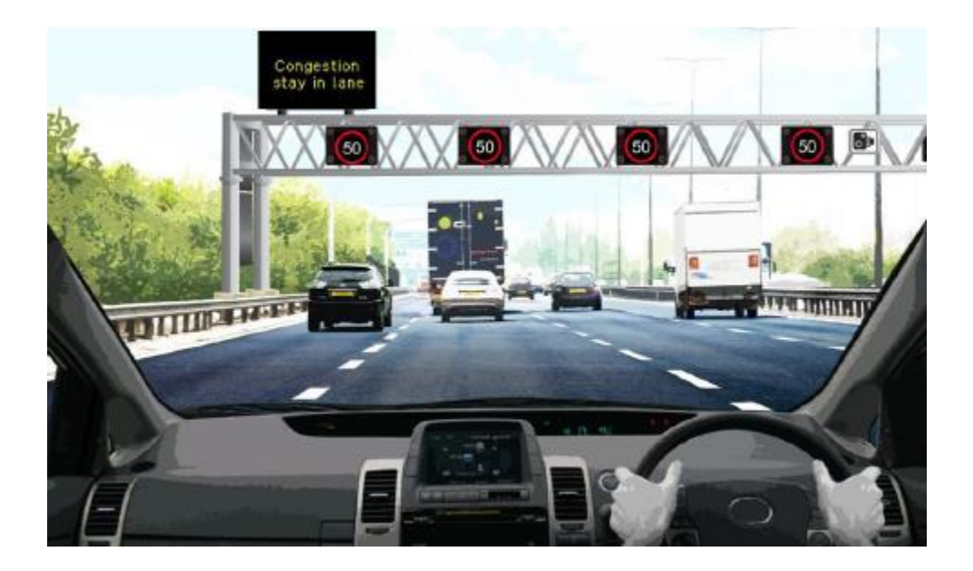
Figure 4c: Illustrative smart motorway all-lane running scheme section operating with variable mandatory speed limits

When variable mandatory speed limits are operational, clear instructions will be given to drivers via speed limit signs. These will be displayed on post mounted advanced motorway indicator signals (where provided), via speed limit signs displayed on the advanced motorway indicator signals or variable message signs above the main carriageway. This is illustrated in Figures 4c and 4d below. The speed limit displayed will take account of prevailing traffic conditions through detectors which are deployed throughout the scheme. The variable message signs located on gantries will provide further information for drivers.