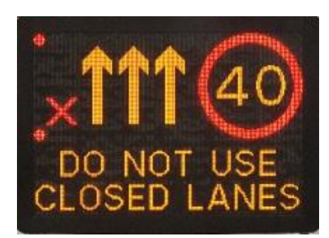
Figure 4g: Variable message sign with lane closure 'wicket' and flashing red lanterns warning of a closed lane

Figure 4f: Variable message sign with a warning pictogram displaying queue caution information and a reduced mandatorv speed limit