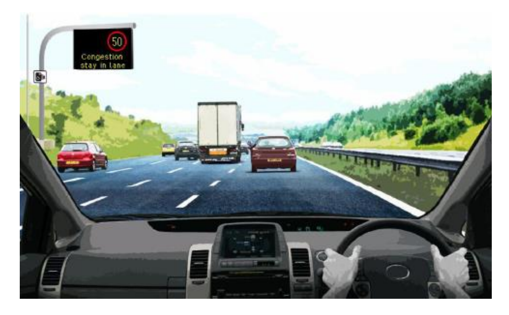
Figure 4d: Illustrative smart motorway all-lane running scheme section operating with variable mandatory speed limits and information for road users