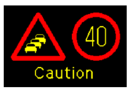
Figure 4f: Variable message sign with a warning pictogram displaying queue caution information and a reduced mandatorv speed limit