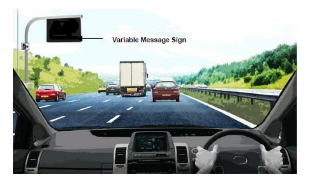
Figure 4b: Illustrative smart motorway all-lane running scheme section operating in normal motorway conditions with a blank cantilever mounted variable message sign