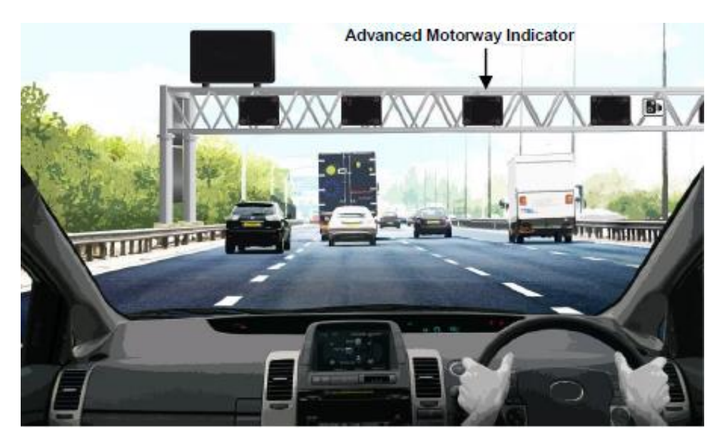
Figure 4a: Illustrative smart motorway all-lane running scheme section operating in normal motorway conditions with blank advanced motorway indicators and blank gantry mounted variable message sign

During normal motorway operation the advanced motorway indicators (AMI) and variable message signs (VMS) will remain blank in respect of speed limits and the motorway will operate as shown in Figures 4a and 4b below. When there are no speed limits being displayed the national speed limit will apply.