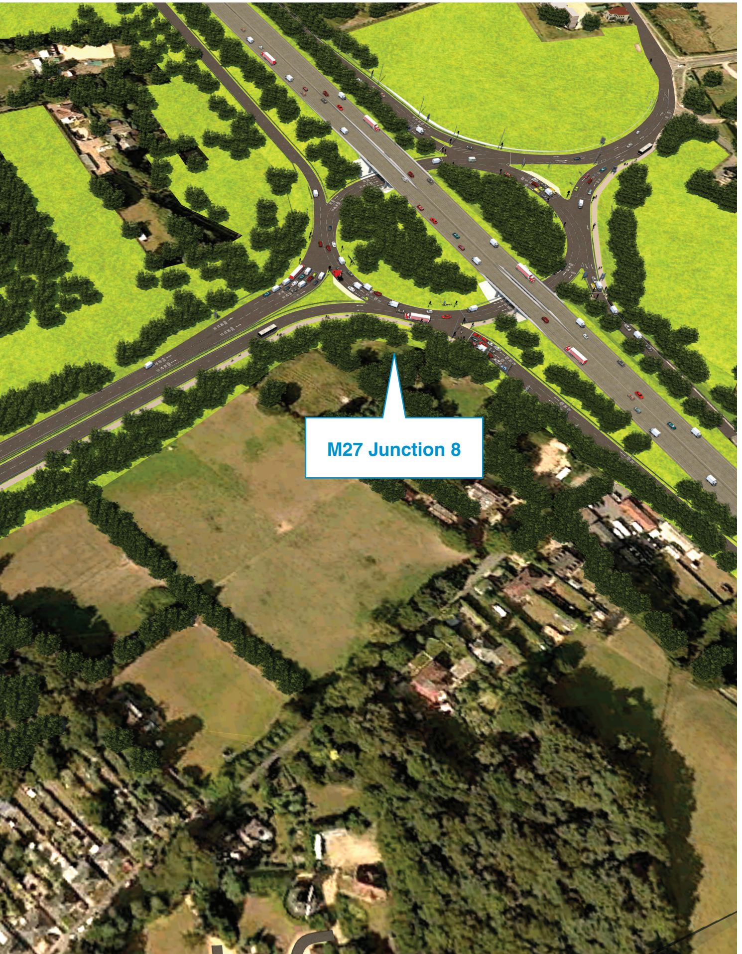
M27 Junction 8