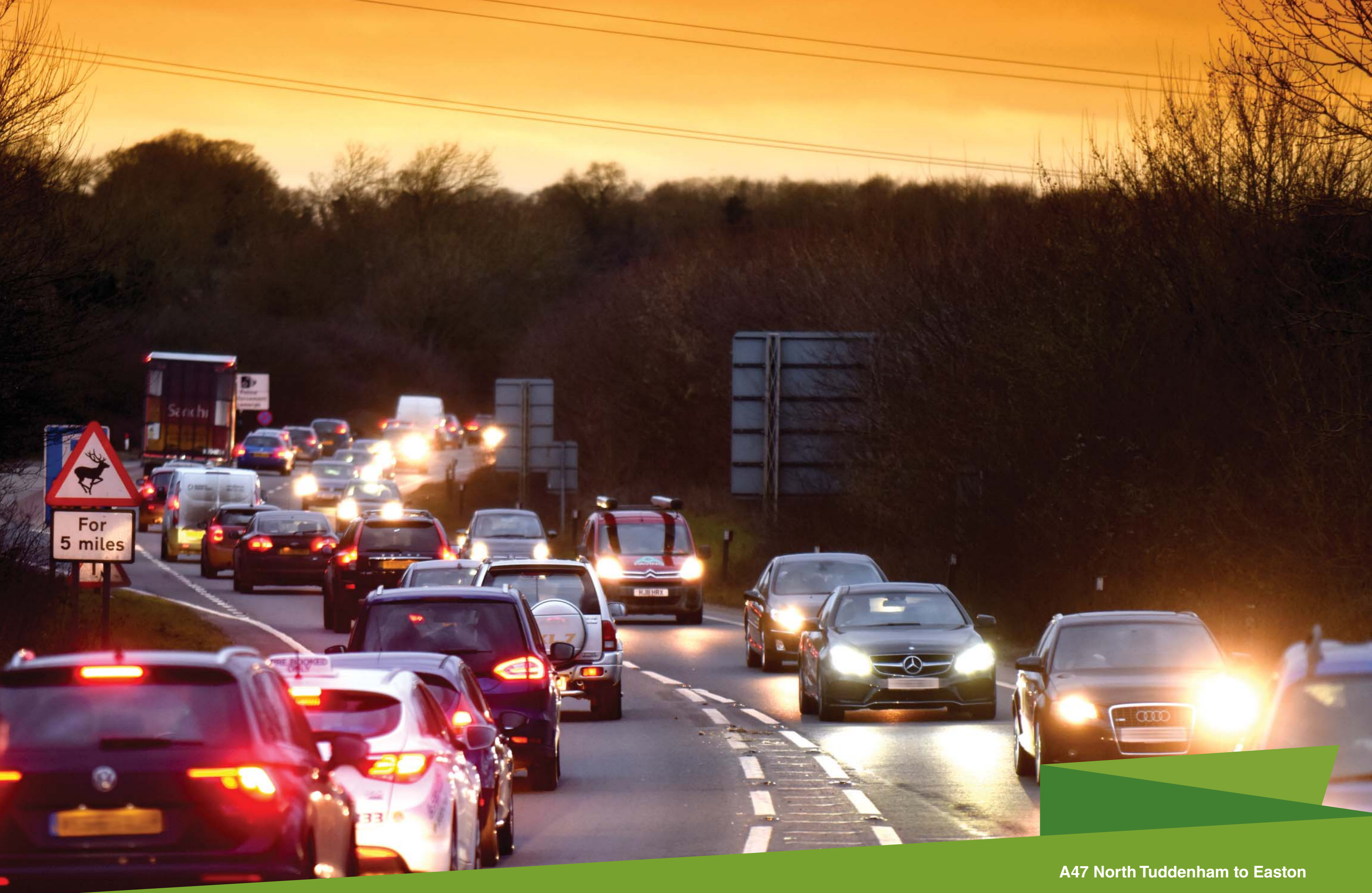
A47 North Tuddenham to Easton