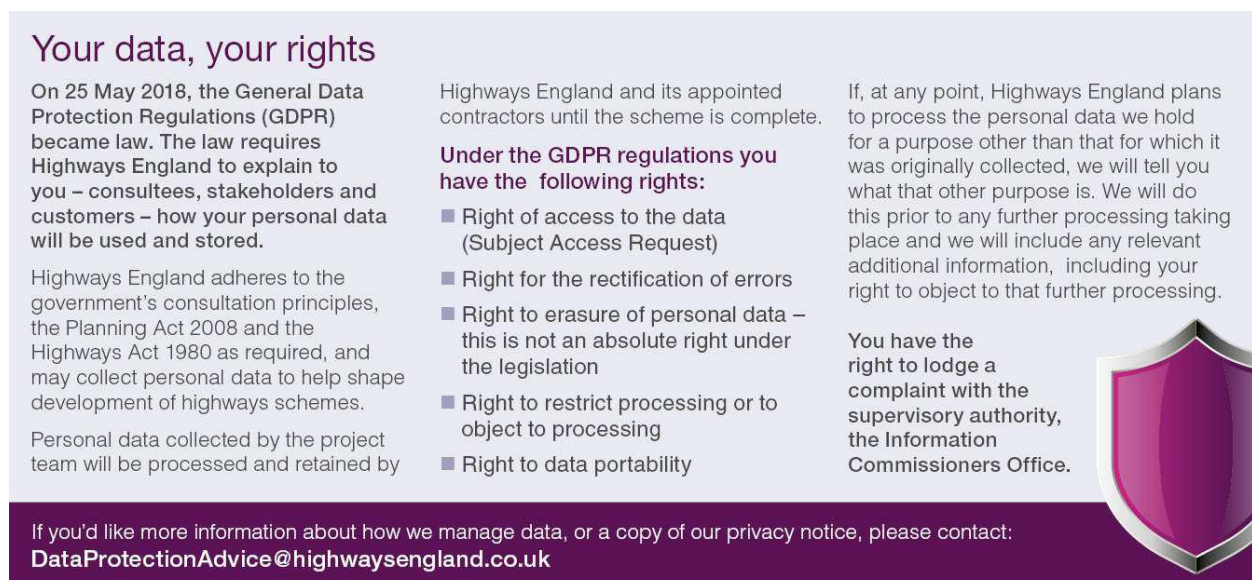
Figure 6.1: Your data, your rights