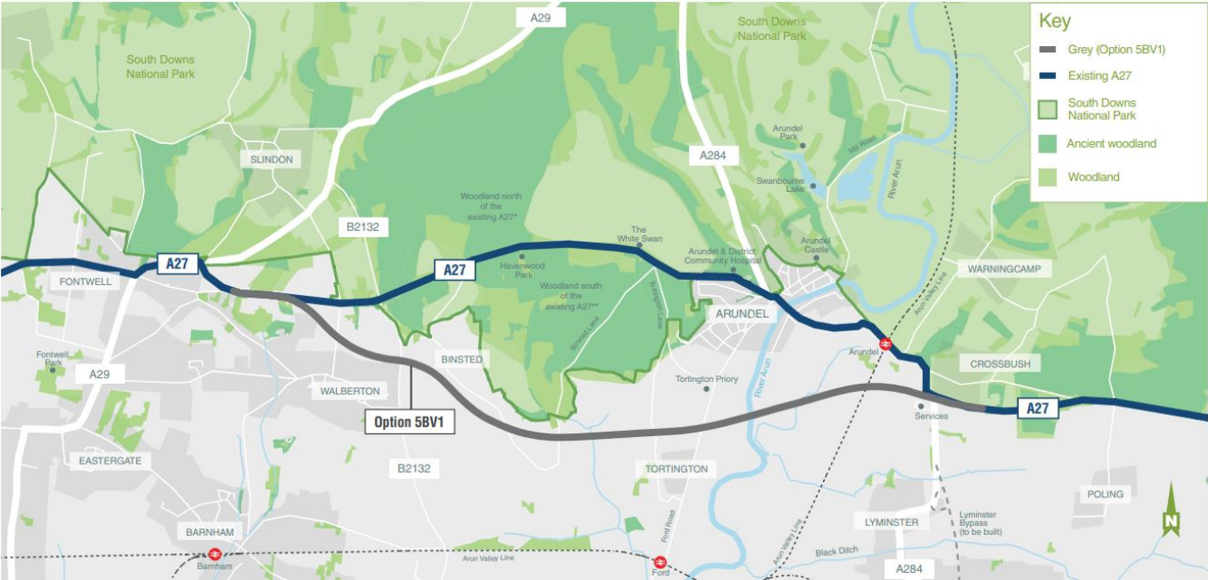
Figure 3-1: The preferred route, subject of the preferred route announcement made on 15 October 2020

3.1.8 The preferred route announcement for Grey (Option 5BV1) was made on 15 October 2020. The reasons for choosing the Grey route are set out in the preferred route announcement brochure, here: https://highwaysengland.citizenspace.com/he/a27-arundel-bypass-preferred-route-announcement/supporting_documents/GFD20_0090%20Arundel%20A27%20Bypass%20Consultation_PRA%20October%202020%20PRINT.pdf . A map of the preferred route is provided in Figure 3-1 below.