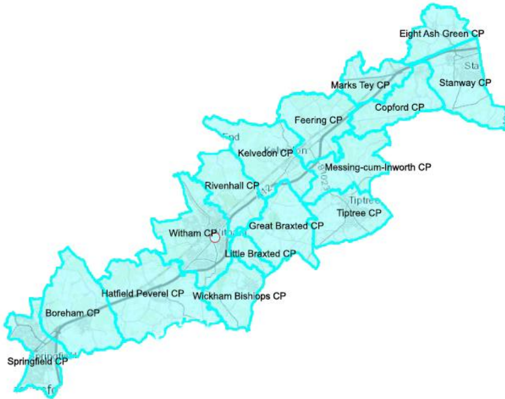
Image 6.1 Mailout zone