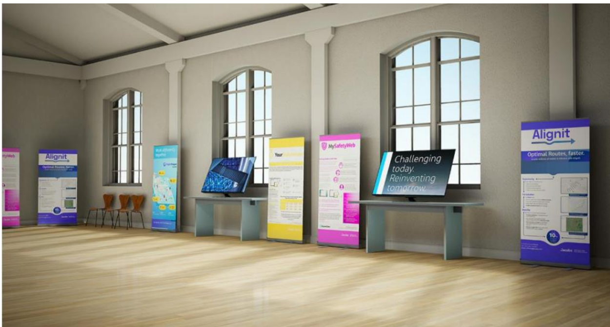
Image 8.1 Example of virtual exhibition space