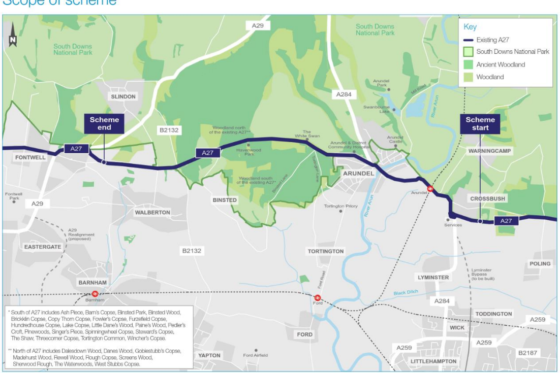
Figure 1 - Scheme location

This project explores solutions for replacing the existing A27 single carriageway road, which lies between the A284 Crossbush junction (east of Arundel), and extends to the west of Arundel, with a new dual carriageway. Figure 1 below shows the scheme location.